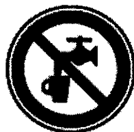
Universal Symbol for Non-Potable Water